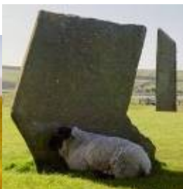
Stones of Stenness