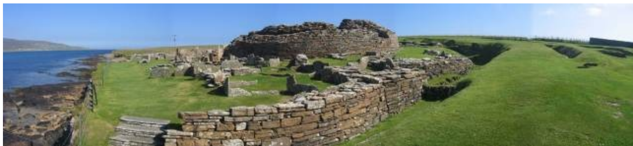
Broch of Gurness