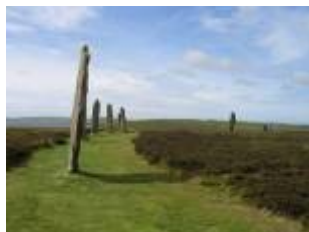
Ring of Brodgar

Another chance to take this fascinating tour.